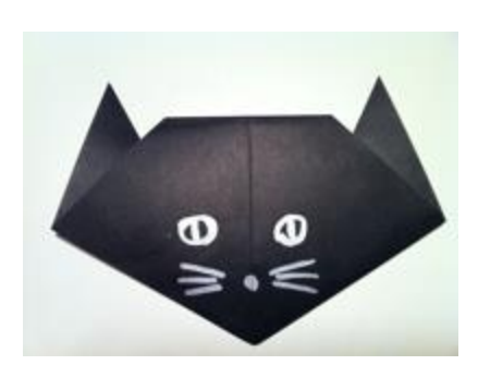
Step 8: Draw some eyes and whiskers!

Click on "Like" below if you like this origami!