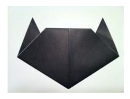
Step 7: Turn the figure over.