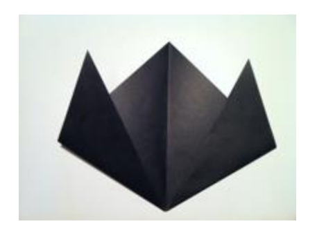
Step 5: Form the ears by folding the left and right corners of the triangle up at an angle, like what you see in the picture.