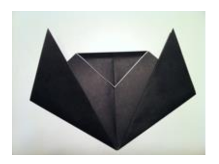
Step 6: Fold a portion of the top corner down.