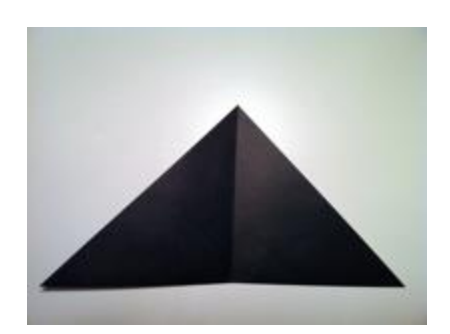
Step 4: Unfold.