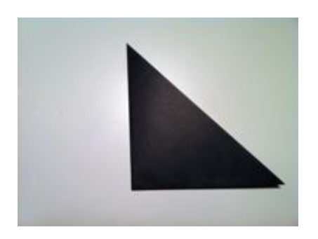
Step 3: Fold in half again by folding left corner to right corner.