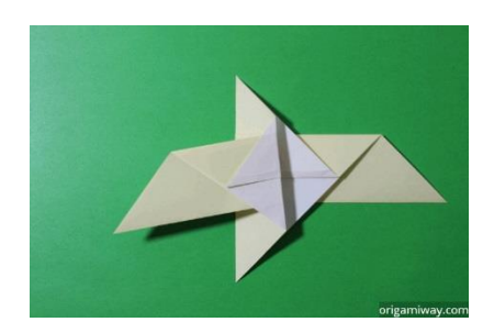
Step 7: Now fold that same flap back like this to make one of the wings.