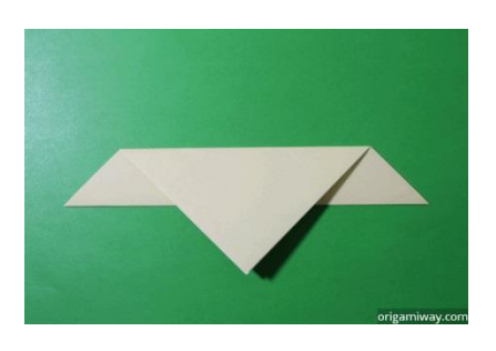
Step 4: Turn the paper over.