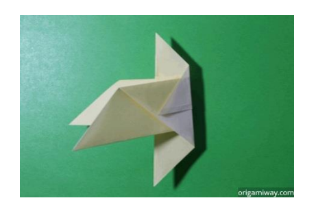
Step 8: Fold the other wing back also.