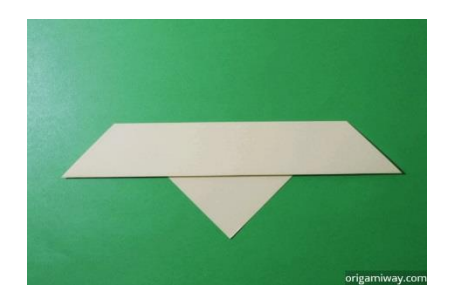
Step 3: Fold part of the top down so that the edge is about halfway down. Don't make this flap too thin because this will become the wings.