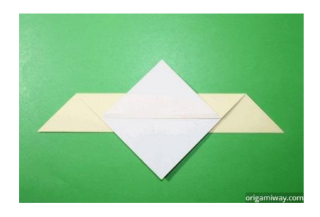
Step 5: Take the bottom corner of the top layer and fold it up like this.