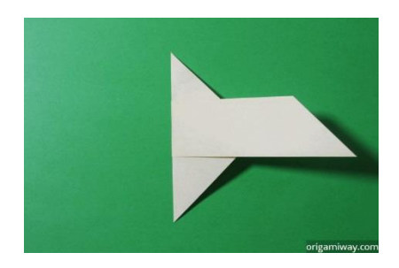
Step 6: Fold the figure in half by folding the left side over to the right.